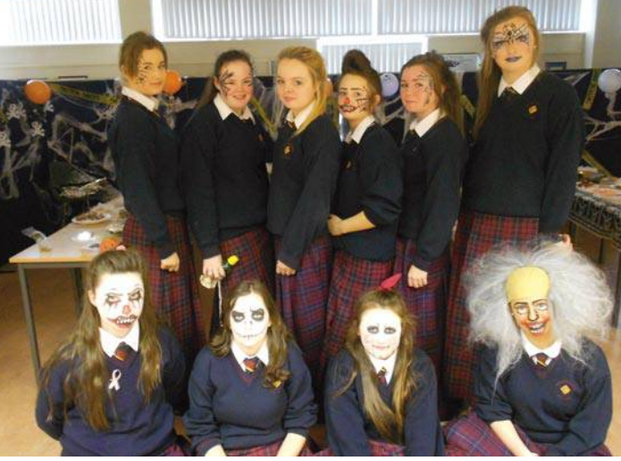
TY students during their Halloween bake sale which raised over €120 for the neo-natal unit in the Limerick Maternity hospital - Thanks to everyone who supported