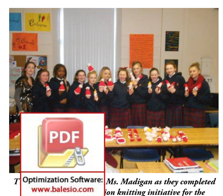
Neo Natal Unit. Well done everyone.